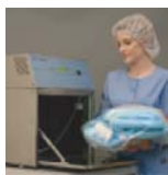
FREE OPERATOR TRAINING

The Professional Series still offers the most gentle 100% EtO sterilization cycle on the market: room temperature sterilization (minimum 68° F), no steam injection, no deep vacuum, and only 17.5 grams of gas .