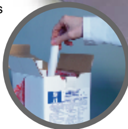
AN71 Refill Kit