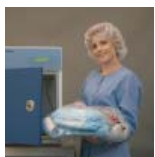
FREE OPERATOR TRAINING

This is the most attractive new Anprolene sterilizer available!