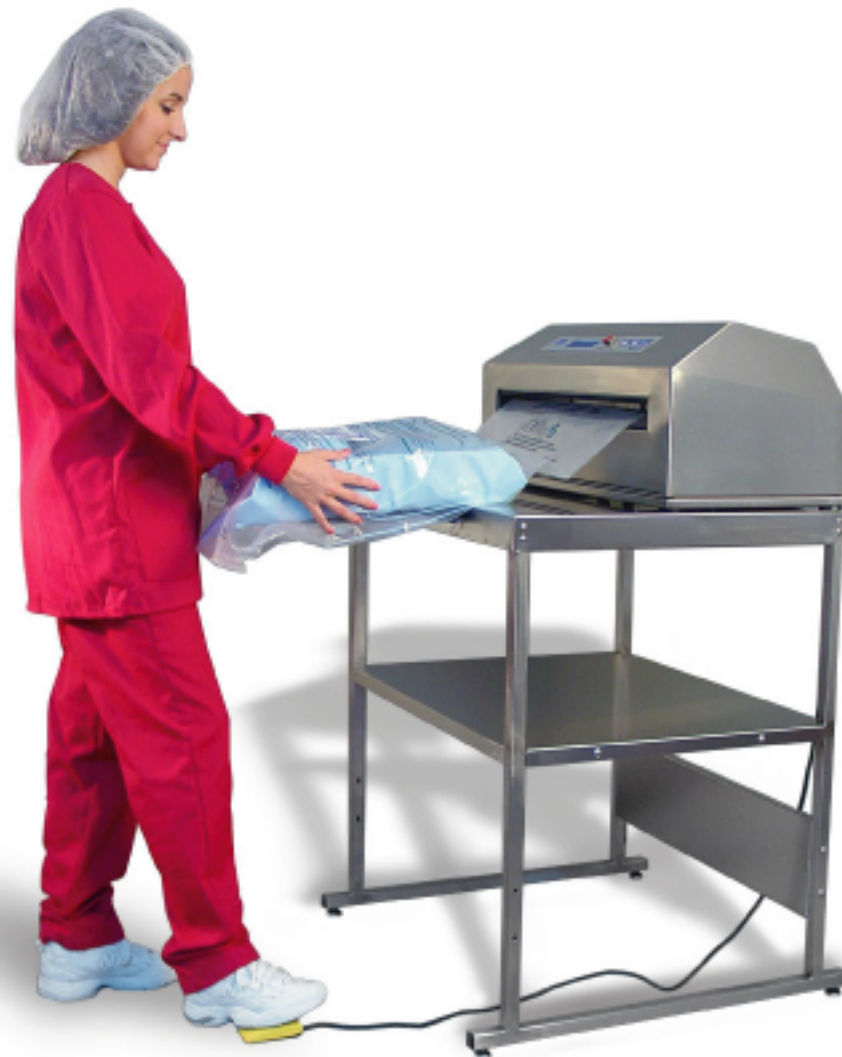
Shown: Model AN5026 with stand

The Andersen Vacuum Sealer is self-contained, easy to maintain and allows multiple configurations for a wide range of applications.